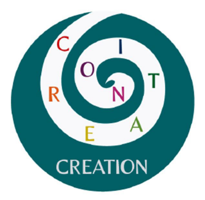
Figure 4. CREATION technique.

Still in the planning stage situations in which the creative performance is not present among the participants it is necessary to describe problem situations in order to encourage the generation of ideas in its respective step (activity 4).