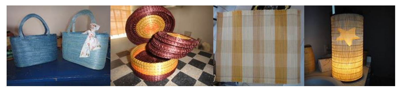
Figure 2. Products manufactured by the communities which are objects of study.