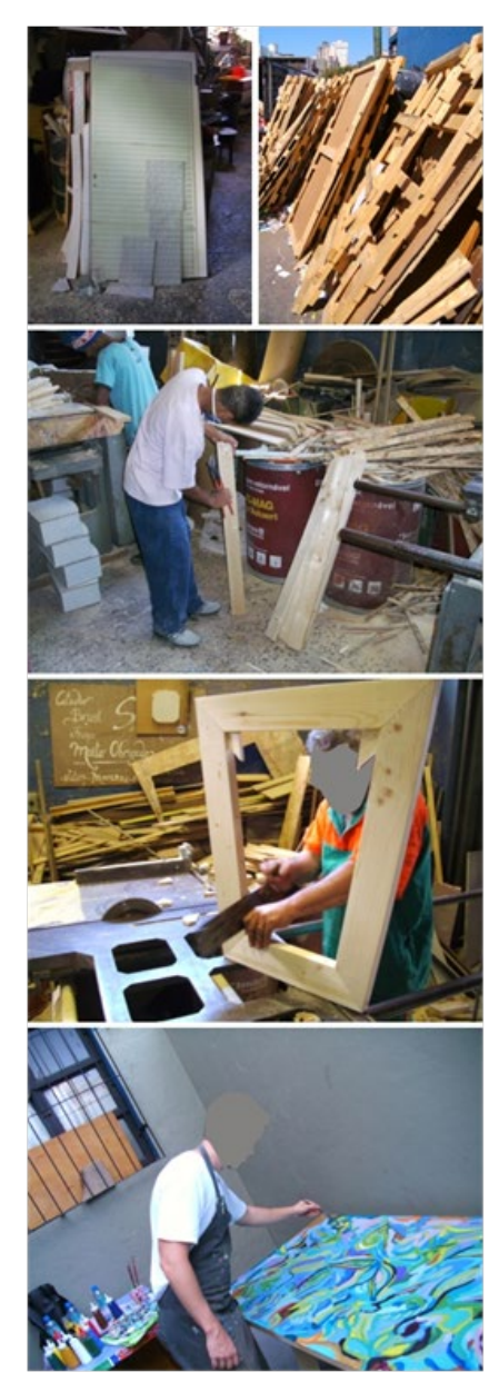
Figure 5. Some stages of the production process of a table made from second-hand donated materials.

manufacturing activities when necessary). In the case of the reuse of materials, identification and selection of the most appropriate materials to a project are required.