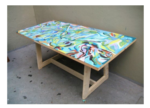
Figure 3. Table made up of reused material (wooden pallets and a door) manufactured in the ASMARES carpentry factory.

The workers who usually attended the carpentry factory on a regular basis during the research period were the Instructor, the Carpenter, Associates and Apprentices. The Instructor and the Carpenter are in charge of most