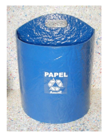
Figure 2. Dustbin manufactured in the carpentry factory.

One of the differentiator factors of the carpentry products in the furniture sector is the continuous demand for an "ecoproduct" (as categorized by the actors involved in the work). In this case, this means making products made up of recycled (such as ecoplaca) or reused material according to a customer demand and to the nature of activities in ASMARE. Ecoplaca boards are not produced by ASMARE. They are acquired from a manufacturer from São Paulo. In most cases, the customers already knew the ASMARE or acknowledged the work carried out there regarding the screening of recyclable materials. Some customers also cooperate in other ways such as donating recyclable materials.