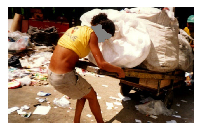
Figure 1. Scavenger and one model of wood cart used by scavengers in Belo Horizonte.

Currently, the production of dustbins made up of ecoplacas increases due to their profitability and to the standardized manufacturing processes. The ecoplaca boards come from factories from Sao Paulo (630 Km from Belo Horizonte). They are stored in the carpentry factory, occupying the area that was previously utilized to store reusable materials. The manufacture of dustbins is conducted through repetitive processes (creativity deployment is not explored) characterized by division of tasks that require very low training. The production of dustbins is based on one pre-set project proposed by external collaborators. This predictable manufacture cycle is gradually replacing the upcycle of furniture from second-hand materials, which is considered a more complex and specialized activity requiring creative skills employment and design effort to usually produce one product from that project. Thus, each object involves a different project attempt.